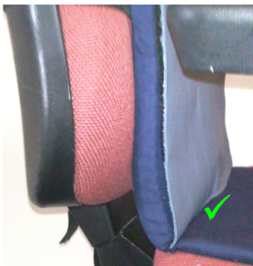
Figure 3 – Correct positioning of the seat pad

The pad must not be placed as shown in figure 4, as the sensors will not be in the correct position and will not make good contact to the occupant's back: