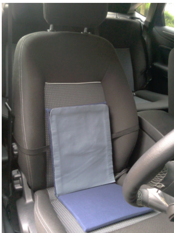
Figure 1 – PS25502PAD seat pad, with leather cover, in place on a car seat