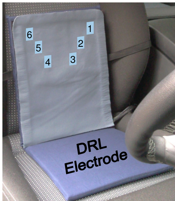
Figure 2 – Showing locations of the 6 sensors and the DRL fabric electrode

The pad also contains a piece of conductive fabric, concealed under the cotton cover on the seat base, which serves as the electrode for the driven ground plane. It should be connected to a Driven Right Leg (DRL) circuit such as the one contained within the PS25006 box, for noise cancellation.