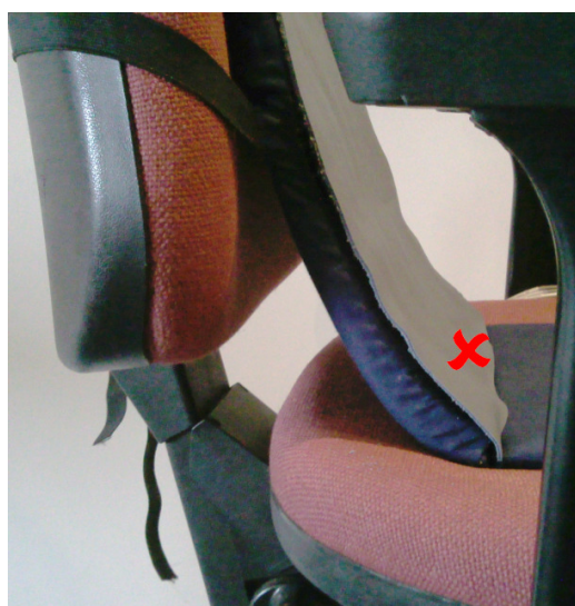
Figure 4 – Incorrect positioning of the seat pad.

The pad must not be placed as shown in figure 4, as the sensors will not be in the correct position and will not make good contact to the occupant's back: